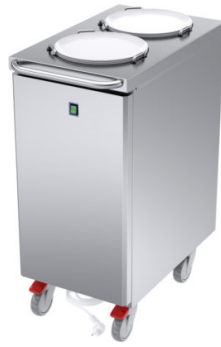
Plate dispenser LJLR 2*280